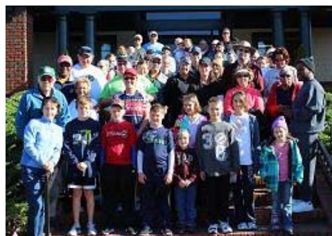
THE PARTICIPANTS OF THIS YEAR'S RIVER LANDING TURKEY TROT.